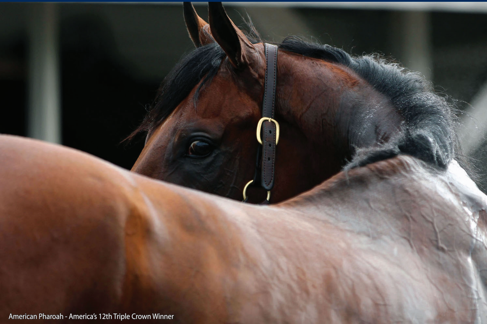
American Pharoah - America's 12th Triple Crown Winner